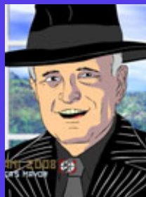
Rudy's Alter Egos

Liberty News TV is a production of the Liberty News Group, a grassroots-funded progressive organization in Portland, Maine. Send tax deductible donations to: